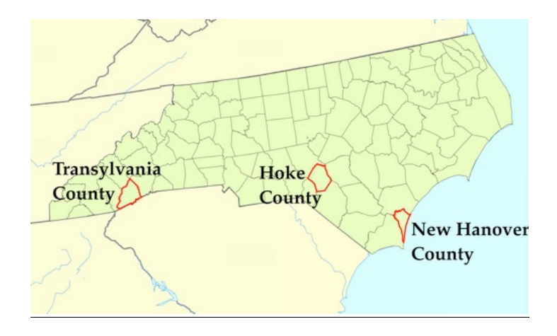
Figure 2. Case study locations in North Carolina